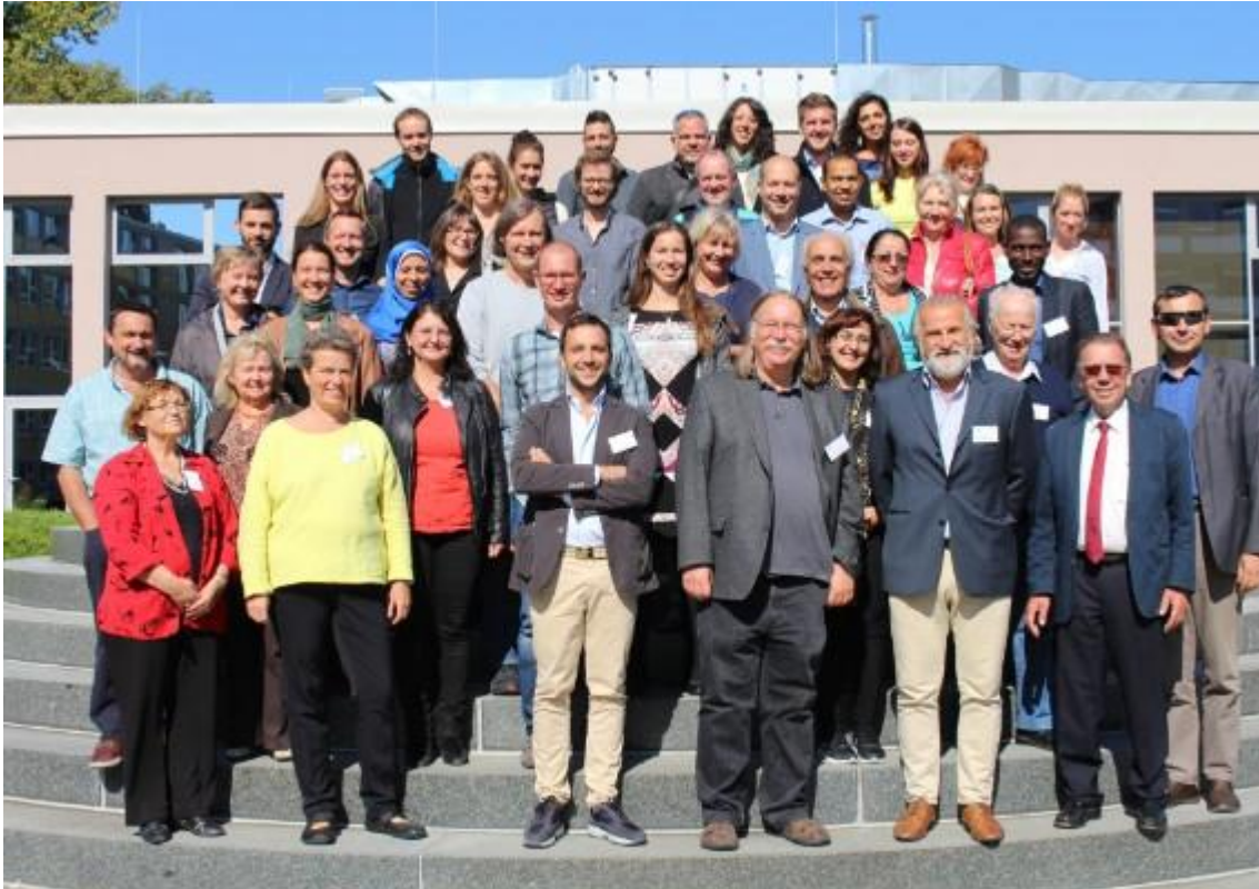
General Meeting Czech University of Agriculture Prague 2016

An international consortium of scientists, led by the University of Hohenheim, Germany, has launched a large, EU-funded, integrated project for the development of alternative fertilization strategies by the use of so-called "bio-effectors". "Resource Preservation by Application of BIOeffECTORs in European Crop Production" (BIOFECTOR) is a unique project in European Union's 7th Framework Programme, bringing together top scientists from academic institutions and small and medium Enterprises with a wide range of topic Expertise.